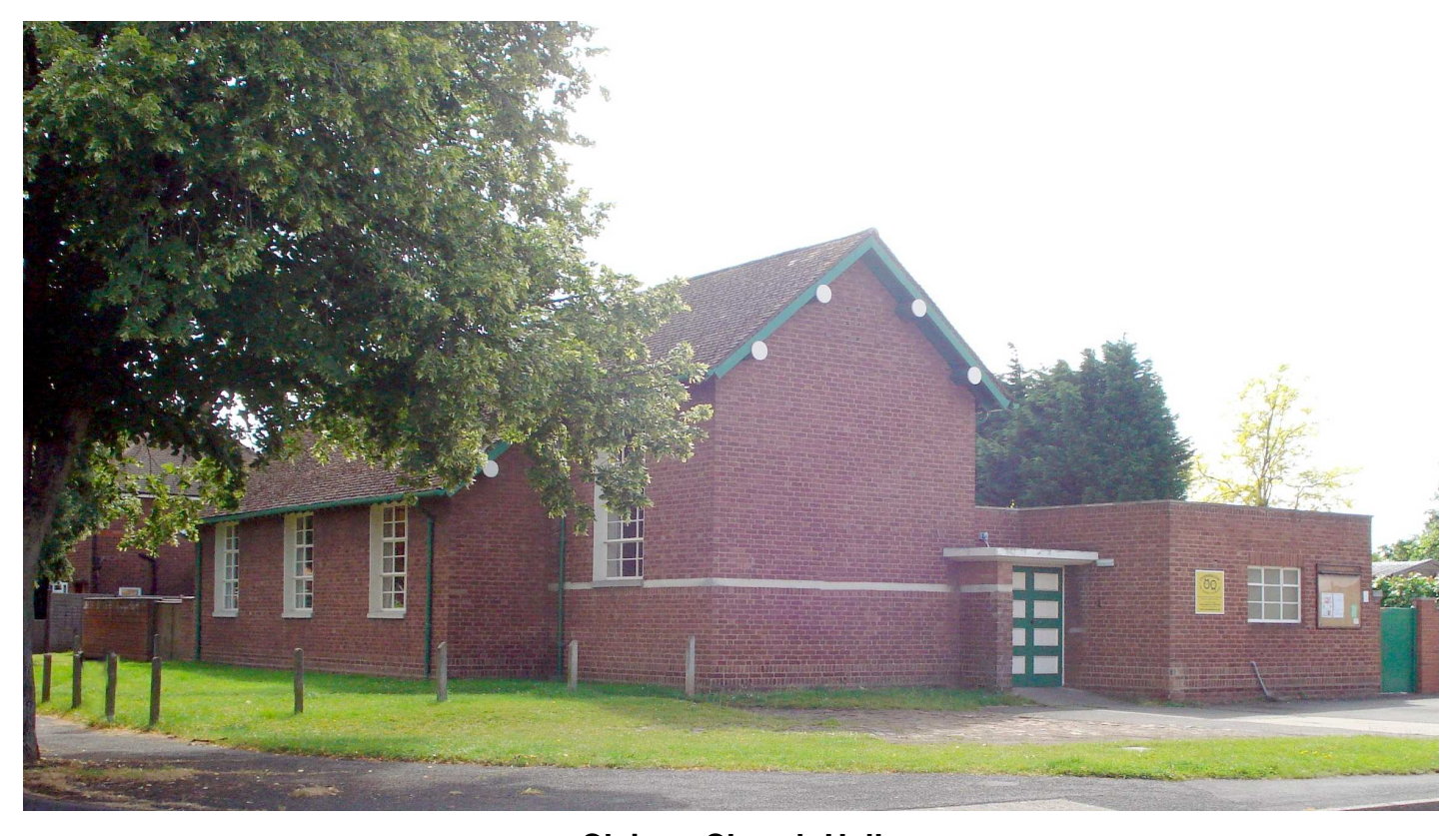
Claines Church Hall

The Hall and the Institute form an important part of the life of Claines and are used both by the Church and a variety of other organisations. The Hall and Institute are run by the Hall and Institute Management (HIM) Committee which is attended by representatives of the users of the facilities.