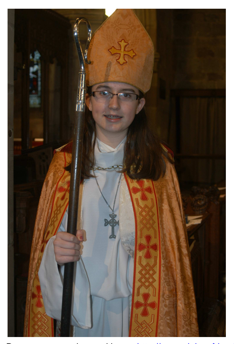
- her Christmas Day sermon can be read here: <a href="http://www.clainesfriends.org.uk/bishop2011.html">http://www.clainesfriends.org.uk/bishop2011.html</a>