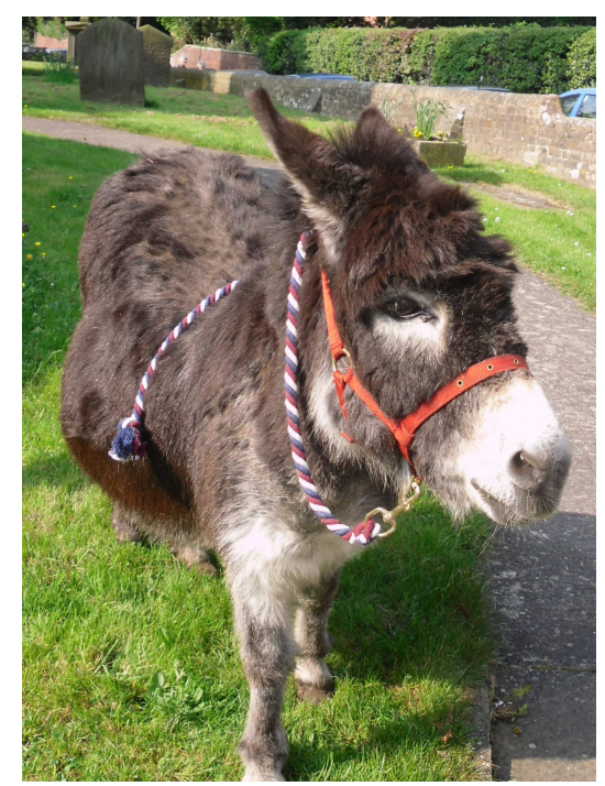
Palm Sunday Procession