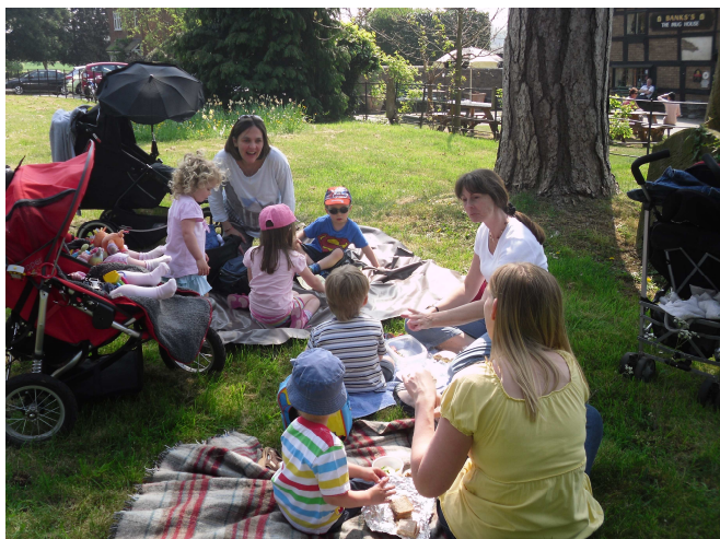
Little Fish Easter Activity Day