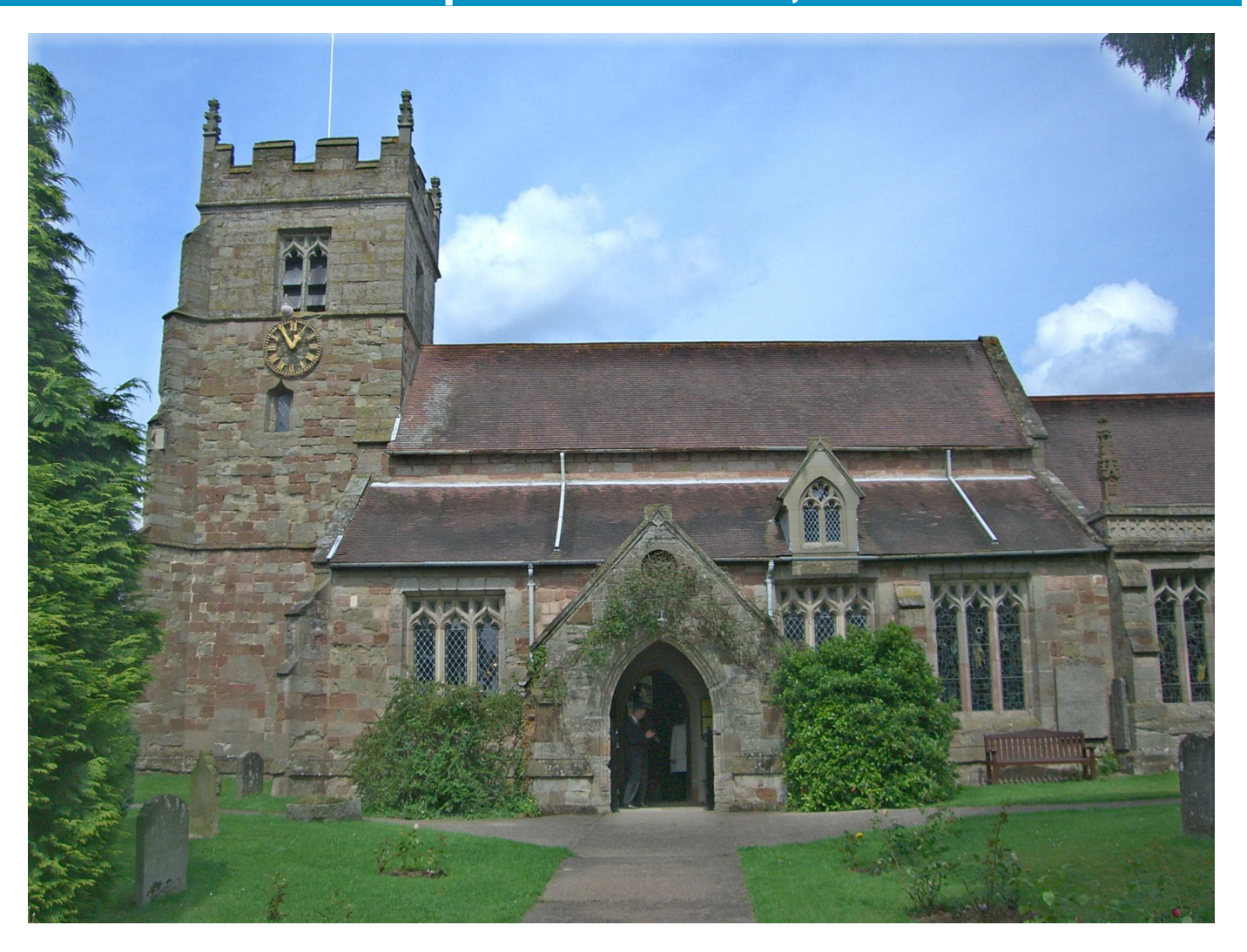
Growing the Kingdom of God "Rejoice in the Lord always. Again I say, rejoice!"